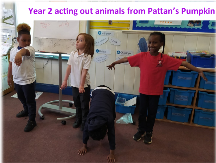
Year 2 acting out animals from Patten's Pumpkin