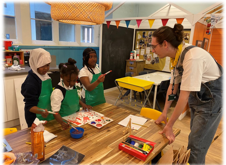
Sunflower with Paint The Town Theatre