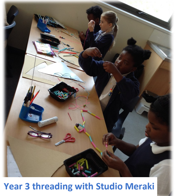
Year 3 threading with Studio Meraki