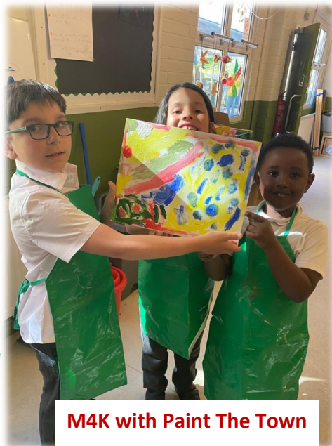
M4K with Paint The Town

Creative learning activities this week at Hannah More!