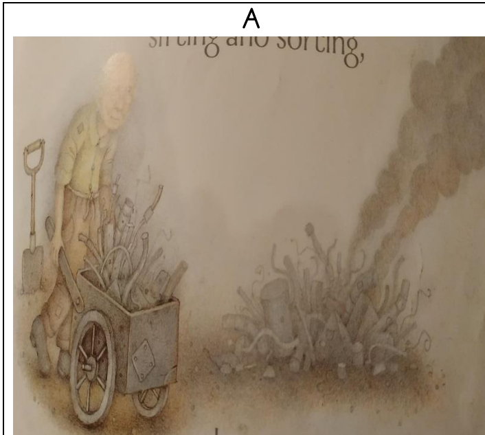
'The forgotten land close to nowhere'

1) Match the vocabulary to Picture A or Picture B.