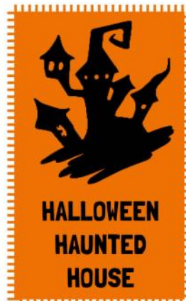
HALLOWEEN HAUNTED HOUSE