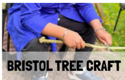
BRISTOL TREE CRAFT

THE KITCHEN WILL BE OPEN AND WE'LL BE ENJOYING SOME SEASONAL TREATS