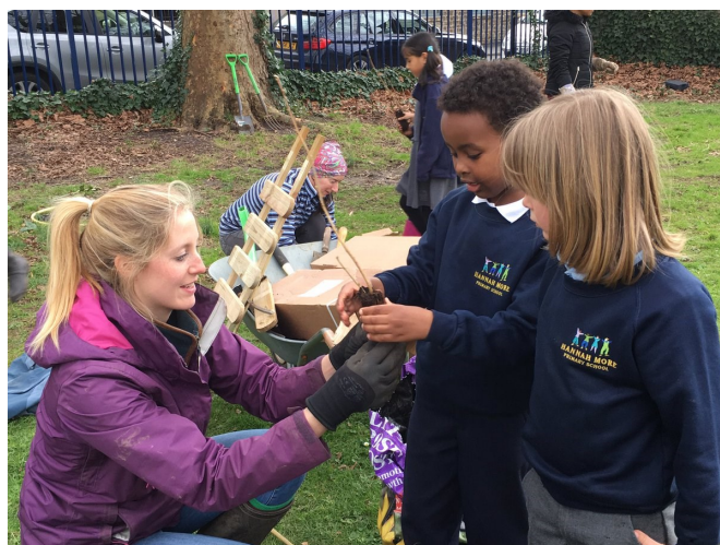
Tree planting with Burges Salmon volunteers!