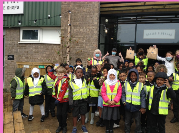
Year 1 trip to Bakehouse