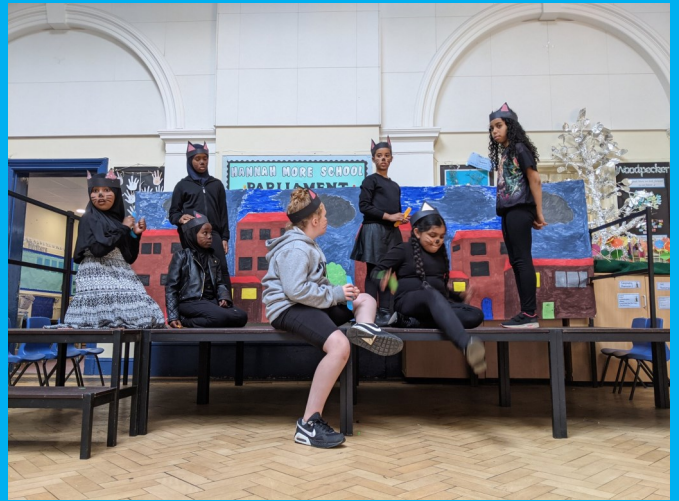
Year 4 performance