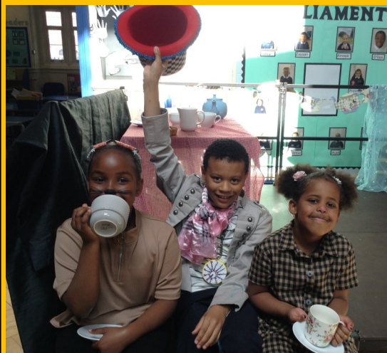
Year 3 performance