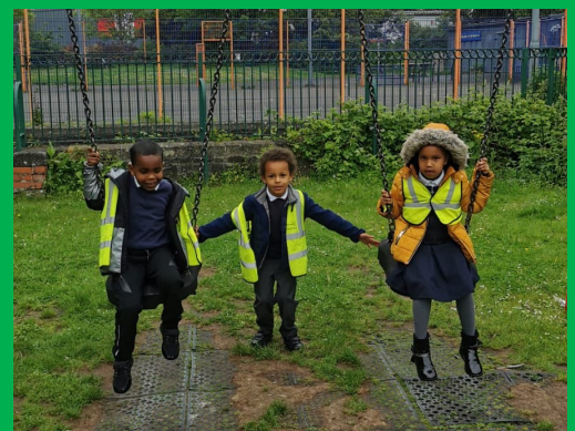
Reception park trip