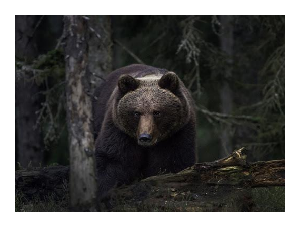
Brown bear in a forest