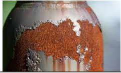
when metal turns brown