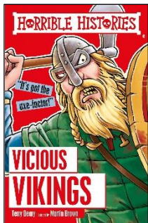
Book about the Vikings