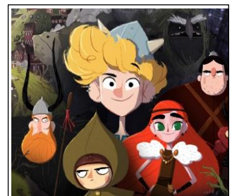
Cartoon on the Vikings