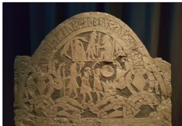
Viking stone art