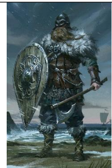
Viking artwork drawn in 2019