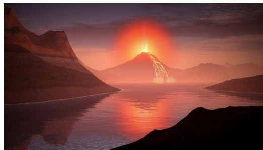
A volcano erupting.

A volcano is an opening in the surface of the Earth in which gas, magma and ash can escape. They come in many different shapes and sizes and can be very dangerous if they erupt.